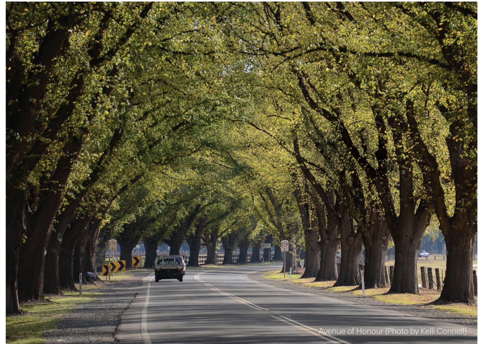
Avenue of Honour

The Bacchus Marsh West Golf Club and numerous recreational facilities all provide places to keep fit and enjoy the great outdoors.