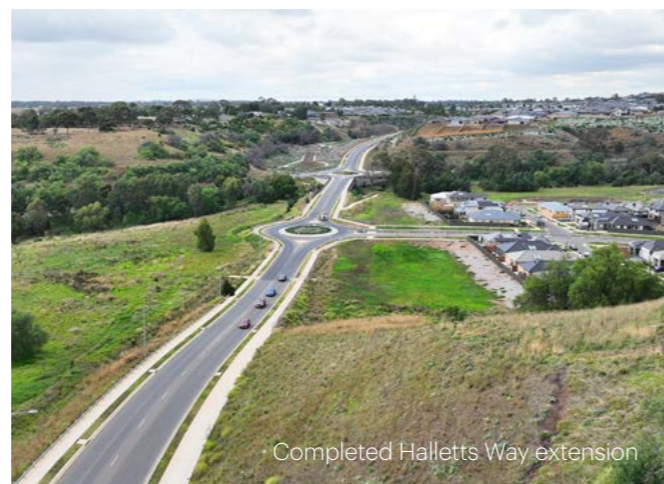
Completed Halletts Way extension